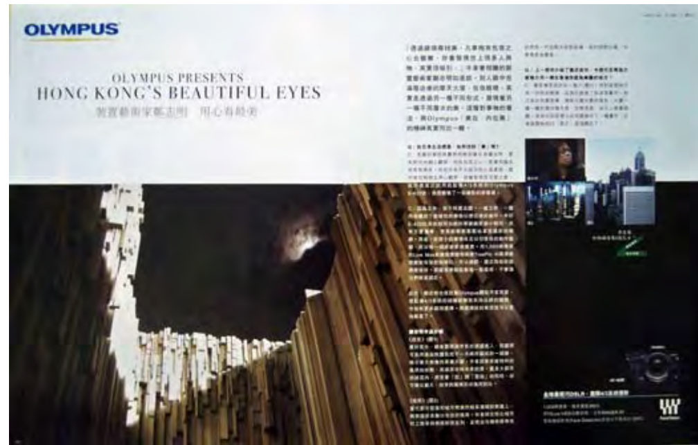
(Top) Olympus featured at their print advertisement on Carl's installation art and his philosophy.