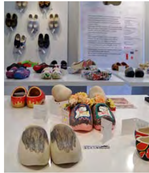
(Top left) Clog painted by Alice.